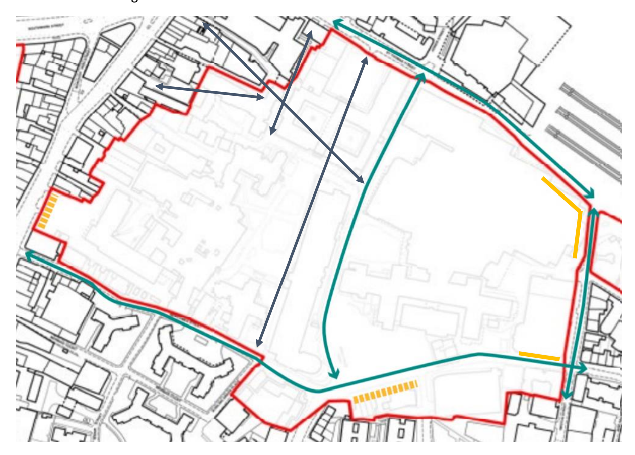
NSP52 - Melior Street to St Thomas Street